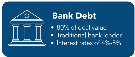
Figure 1. PIE Helps Small Business Owners Access Different, More Affordable Sources of Capital

of their own. When possible, PIE helps business owners make even higher down payments to limit their reliance on debt to 70 percent of the property value (see Figure 1). In return, PIE takes an equity position in the property (not in the business) of 19 percent or less. If PIE's total investment in the property is larger than a 19 percent equity stake, additional funds are mezzanine loans.