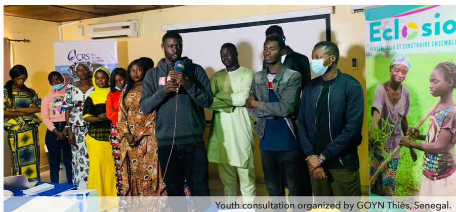
Youth consultation organized by GOYN Thiès, Senegal.

As an example, in the community of Thiès, Senegal, the GOYN team organized a series of four consultations with a representative group of 50 OY to hear about their lived experiences, better understand the barriers they face when pursuing economic and livelihood opportunities, gather insights on how to best