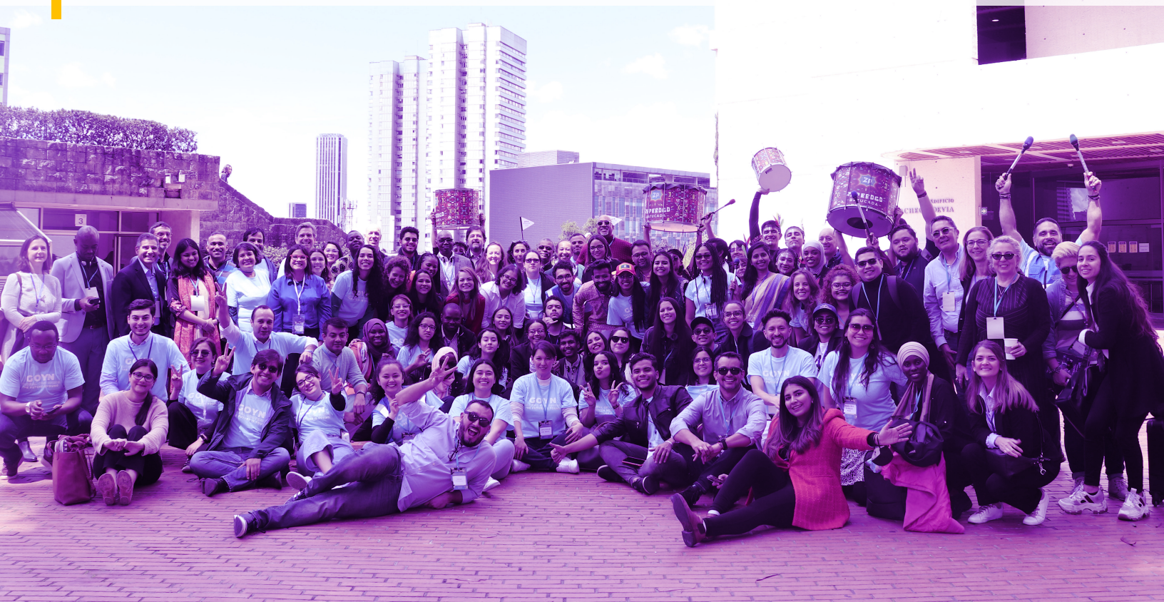
Opportunity Youth with GOYN's team and partners at the GOYN Global Convening 2022 in Bogotá, Colombia.

GOYN's vision is that Global Opportunity Youth have equitable access to dignified and productive entrepreneurship and employment pathways.