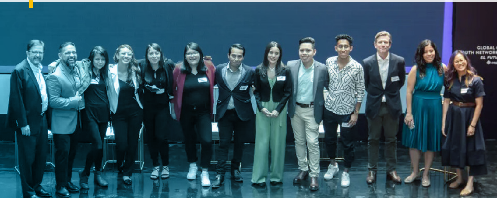
GOYN launch event, Mexico City.

GOYN has four Core Principles that promote authentic engagement and partnership with Opportunity Youth: