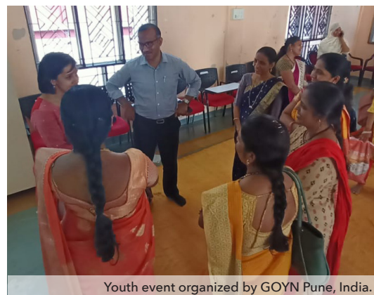
Youth event organized by GOYN Pune, India.